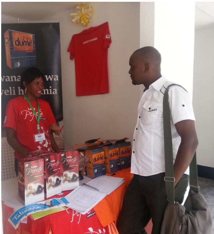
A brand demonstrator from T-MARC Tanzania provides product information to a visitor at T-MARC's product demonstration booth at the Saba Saba 2013 trade fair.