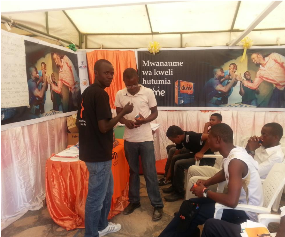
Through “Jali Maisha” (value life) sessions, men who visited T-MARC’s pavilion at the Saba Saba trade fair received information on HIV/AIDS prevention and the correct use of male and female condoms. In this photo a brand demonstrator tests a participant’s skills on the correct use of Dume male condoms.