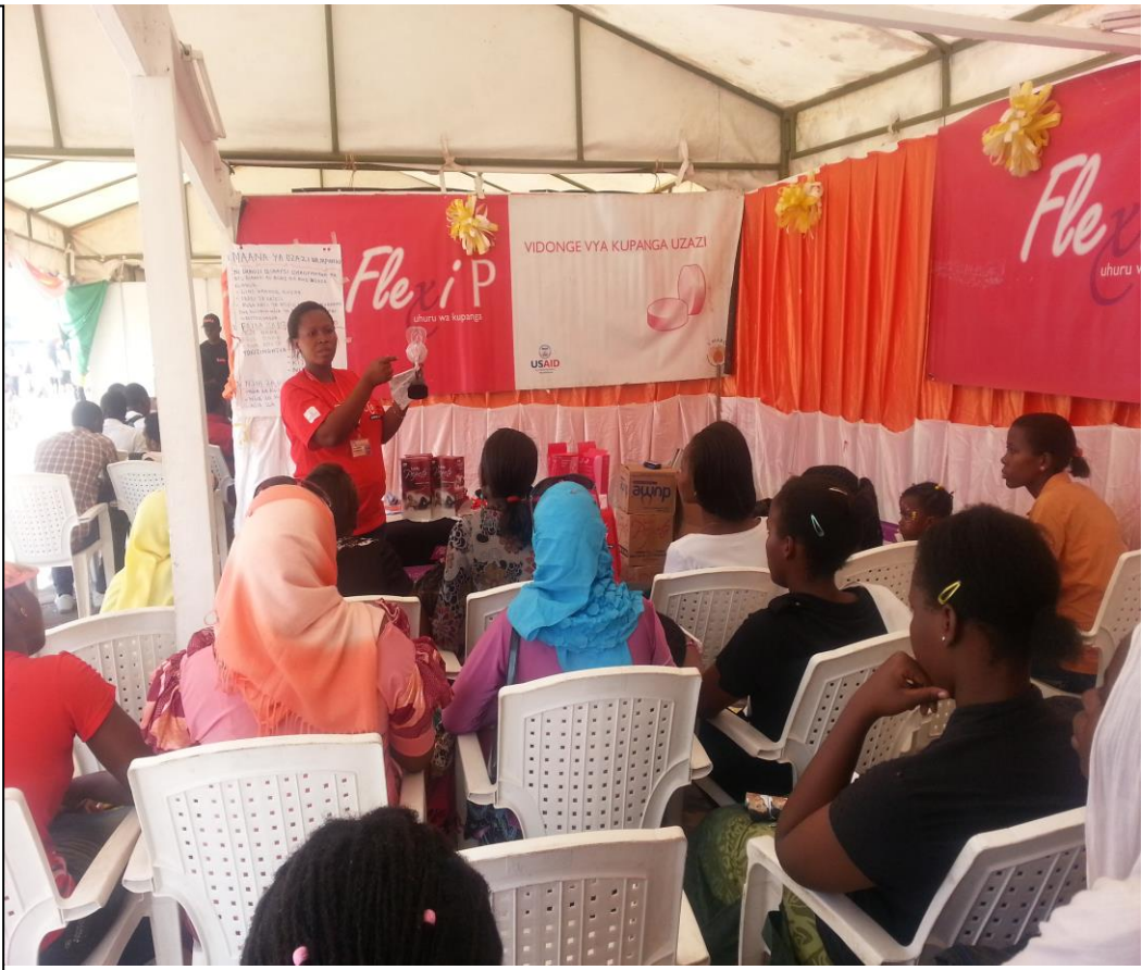
Lady visitors to T-MARCs HIV and Family planning pavilion received training on family planning and HIV/AIDS prevention methods including the correct use of Lady Pepeta female condoms.